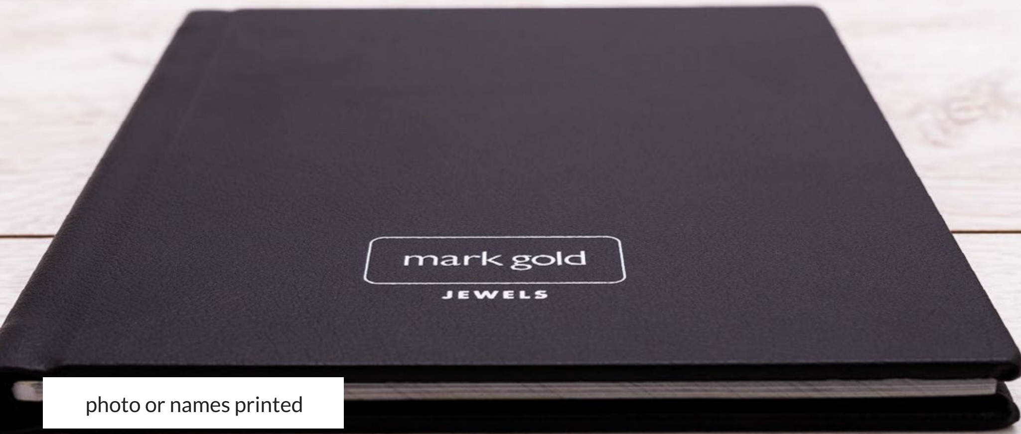
photo or names printed